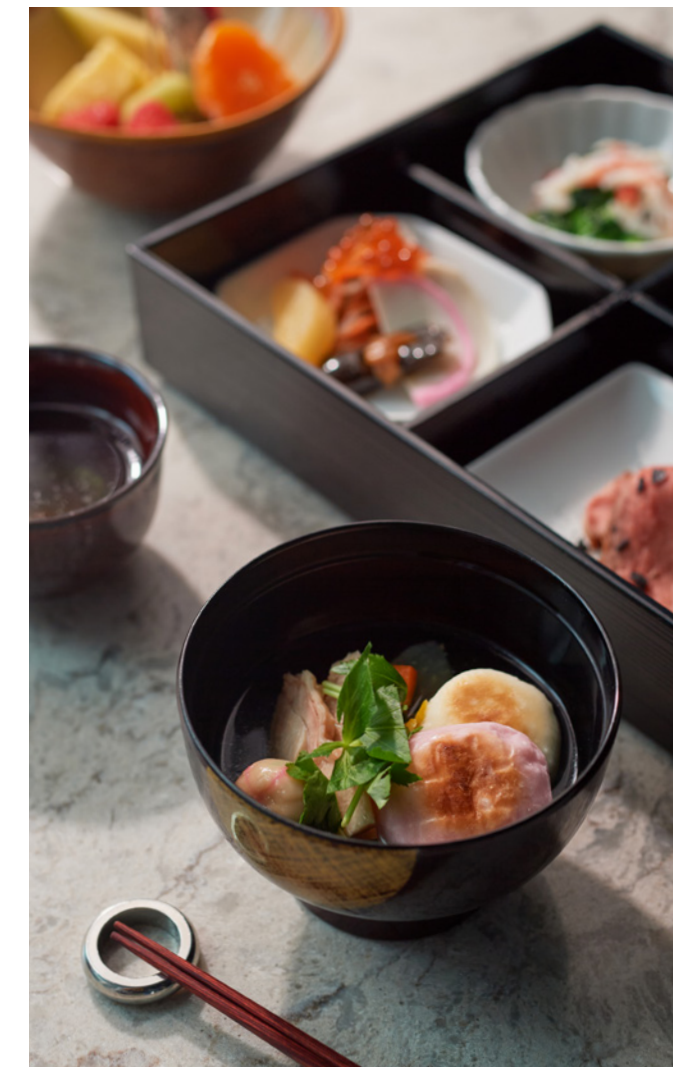
Culinary delights abound.

Visit Tokyo's famed Tsukiji outer market with a Michelin-distinguished chef to source fresh, seasonal ingredients for a cooking class. Learn the secrets of preparing and presenting different Japanese dishes under the guidance of your chef, enjoying the fruits of your labour and a sake tasting.