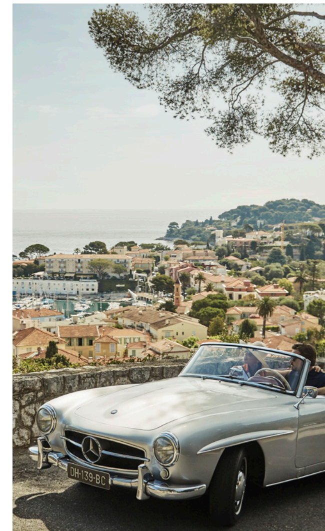
Vintage car ride to Monte-Carlo

Farewell doesn't have to mean goodbye—at least not yet. Opt to extend your journey to spend some time exploring the best of the French Riviera before embarking on your flight home.