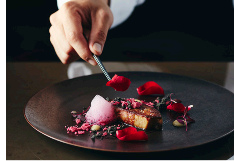
Exquisite dining experiences