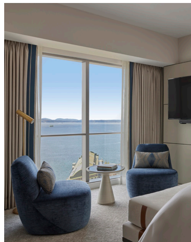
Dramatic Elliott Bay views from Four Seasons Hotel Seattle