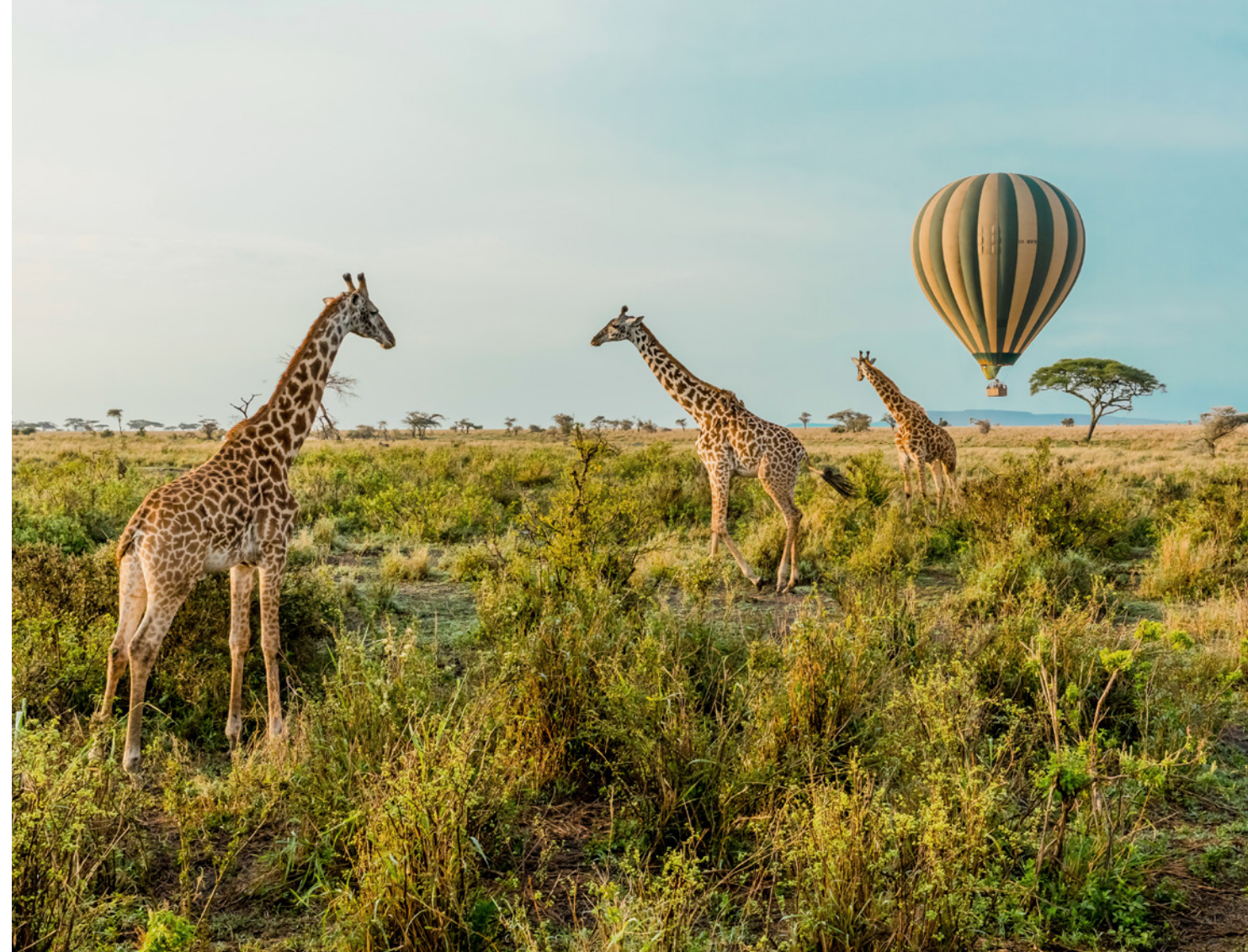
Hot-air balloon ride

Your journey through the world's most pristine landscapes continues in Serengeti National Park, where you are surrounded by the beauty of the land and its wild inhabitants. Your safari begins the moment you arrive, with a game drive to our lodge. Over the next three nights, choose from half-day or all-day game drives that bring you up close to Africa's largest and most diverse concentration of wildlife.