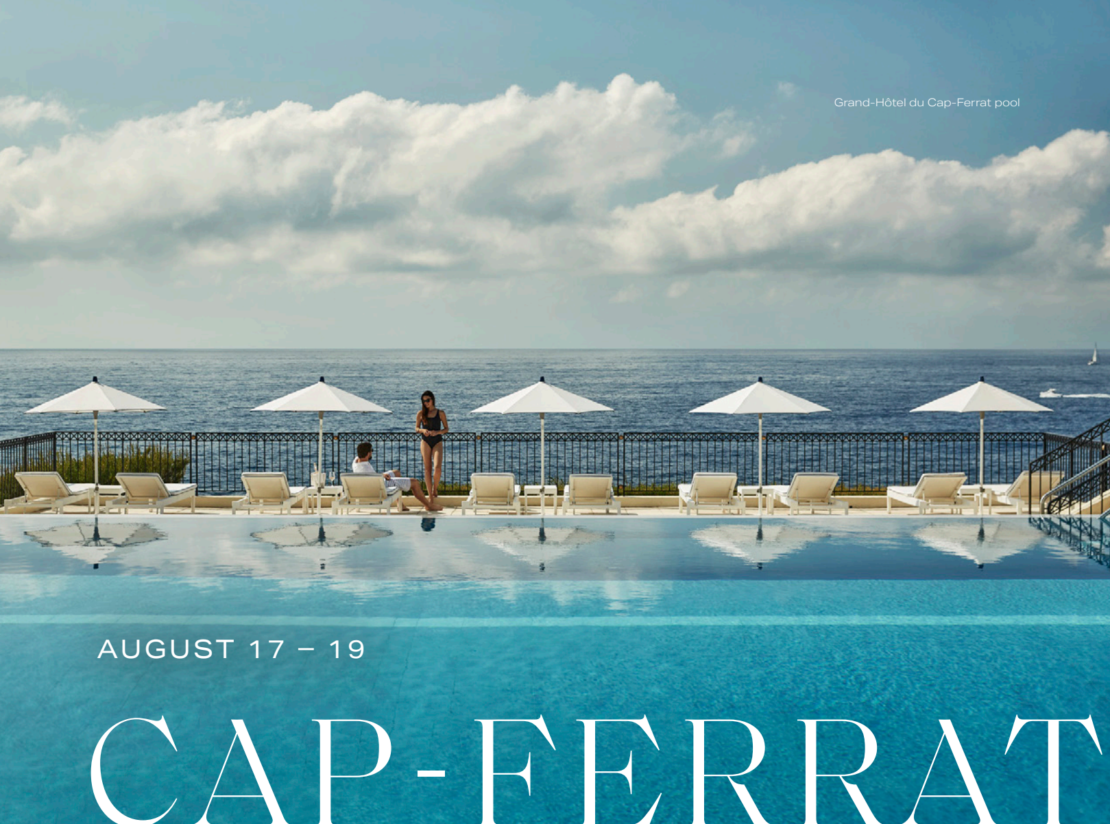
Grand-Hôtel du Cap-Ferrat pool