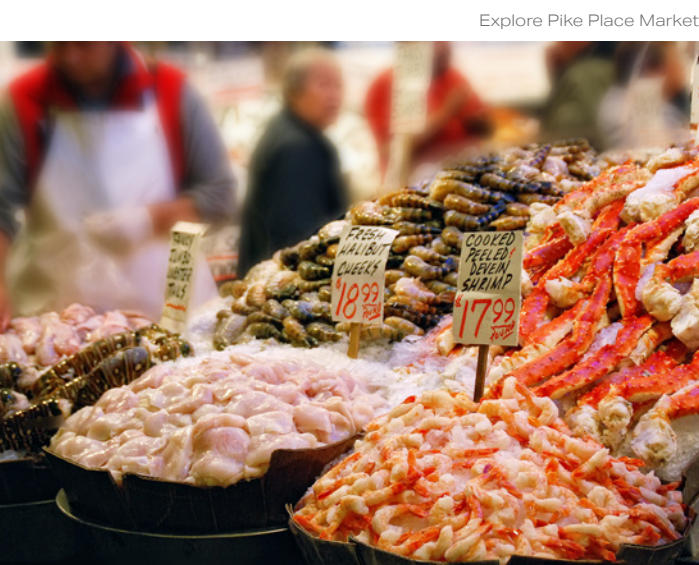
Explore Pike Place Market

Browse local museums, delve into the city's food and coffee scene, spend time on the water, or find out how Boeing airplanes are made on a factory tour—however you want to discover Seattle, we can design a unique itinerary with sightseeing options just for you.