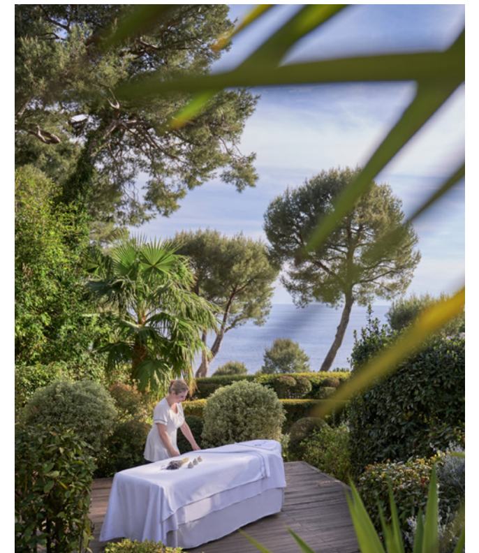
Outdoor spa service, Grand-Hôtel du Cap-Ferrat

Immerse yourself in culinary mastery with a curated mix of dining experiences from special-event group dinners with your fellow travellers to opportunities to dine at local restaurants on your own. Our Onboard Concierge is always on hand to personalise each experience for you, whether providing restaurant recommendations, making dinner reservations, or ensuring your morning coffee is prepared just the way you like it.